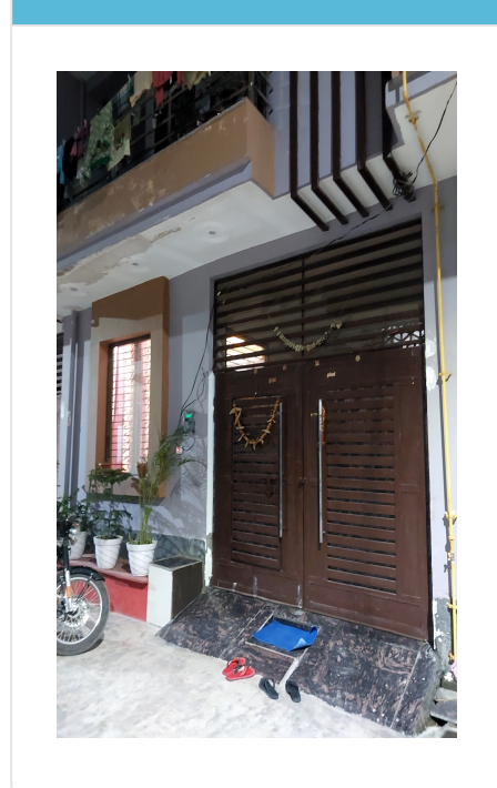
House Image II